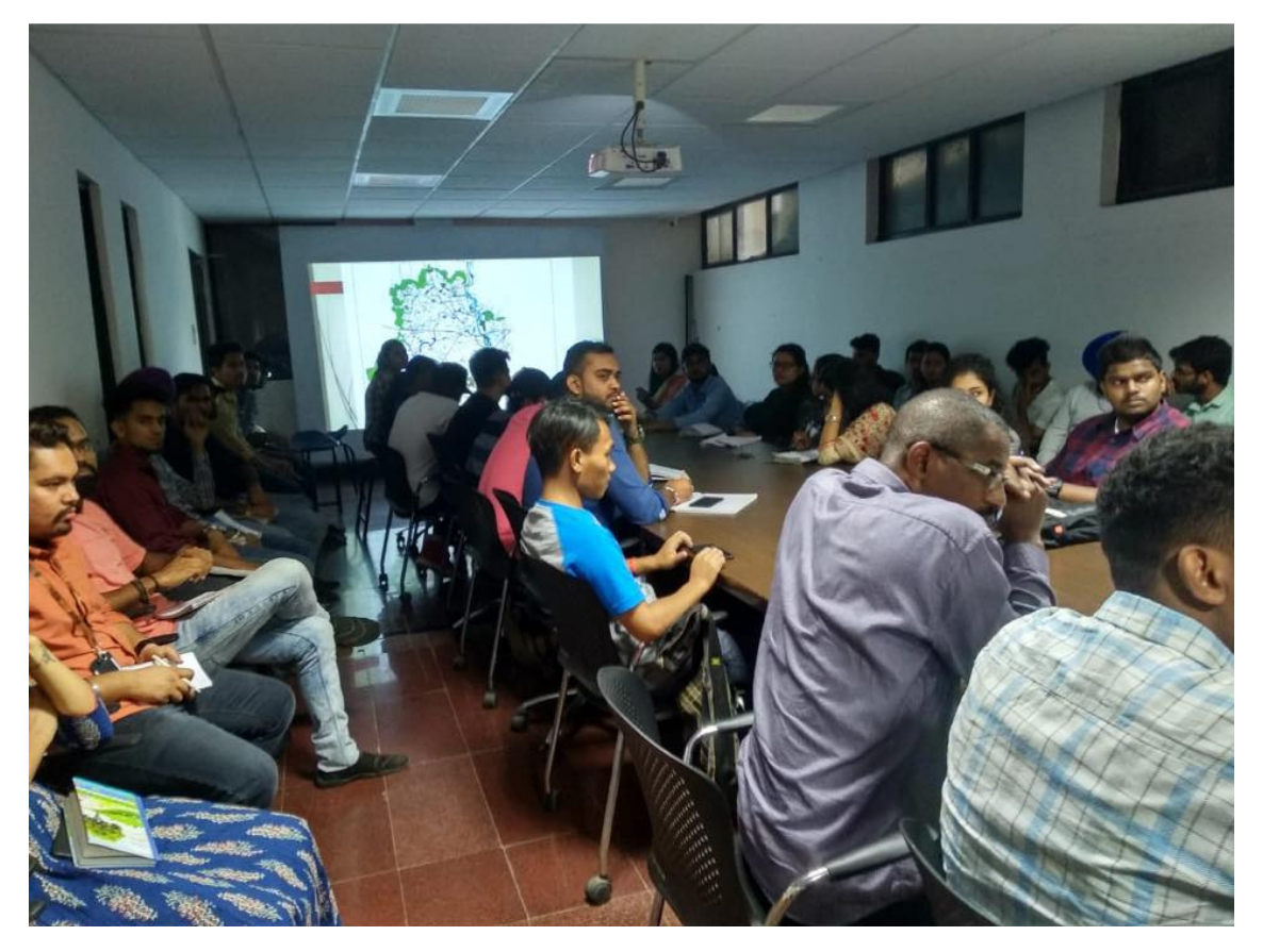
Picture 8 Round Table Discussion on Wastewater Management (with focus on Delhi NCT)

Today, the treatment of water is a well-known process and is executed by state of the art techniques. The sludge resulting from this process represents the next challenge for the water treatment industry, in particular the minimizing of its volume.