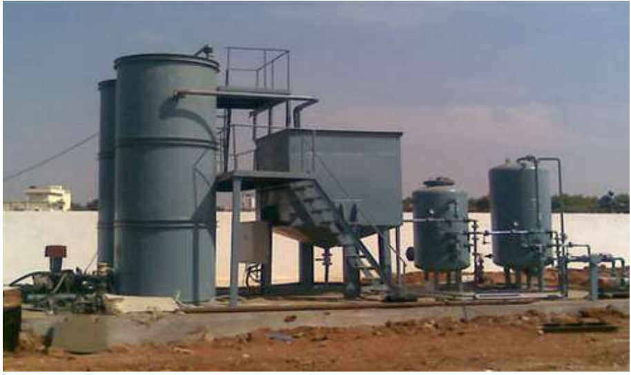
Figure 3: Picture of a MBBR wastewater treatment plant (for representation purpose only; not to the scale)