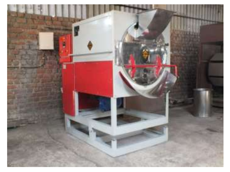
Figure 2: Picture of rotary dryer (for representation purpose only; not to the scale)