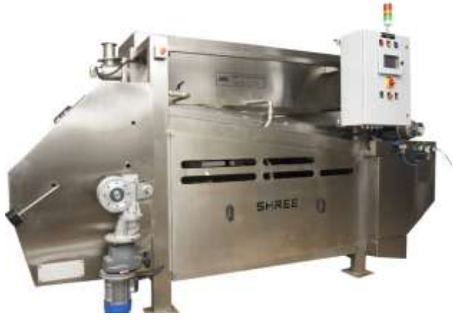
Figure 1: Diagram of belt press (for representation purpose only; not to the scale)