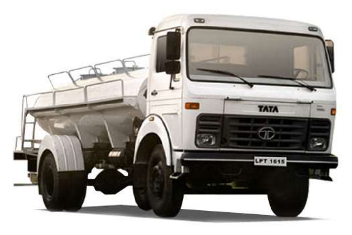
Figure 5: Schematic Representation of Water Tanker