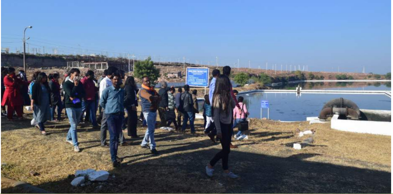
Figure 9: Visit to Sewage Treatment Plant, Badwai, Near New Jail, Bhopal