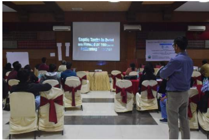
Figure 8: Presentation through Case Study video