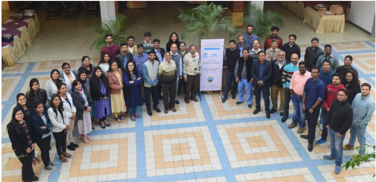
Figure 15: The participants

In summary, the training program was a success as it was able to achieve all the objectives. Participants were from all over the country and of different professional backgrounds. The resource persons were able to deliver their subject matter and also answer the queries and doubts raised by the participants. In their feedback the participants gave a very high rating to the program. The logistics of the program were also highly appreciated by the participants. There is scope for improvement both in the method of conducting individual sessions and time allocation for constituent topics.