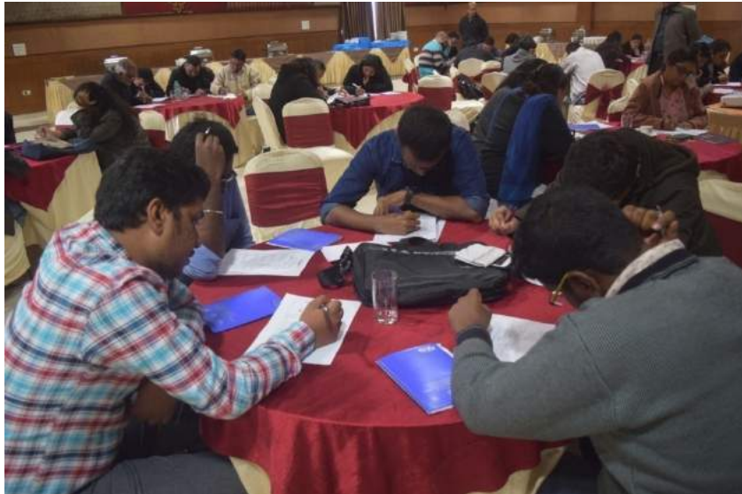
Figure 13: Participants attempting the quiz