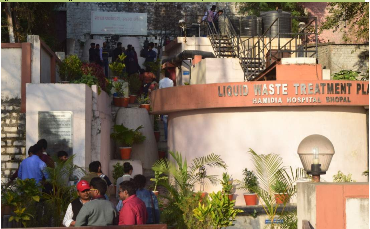
Figure 10: Visit to Liquid Waste Treatment Plant, Hamidia Hospital, Bhopal