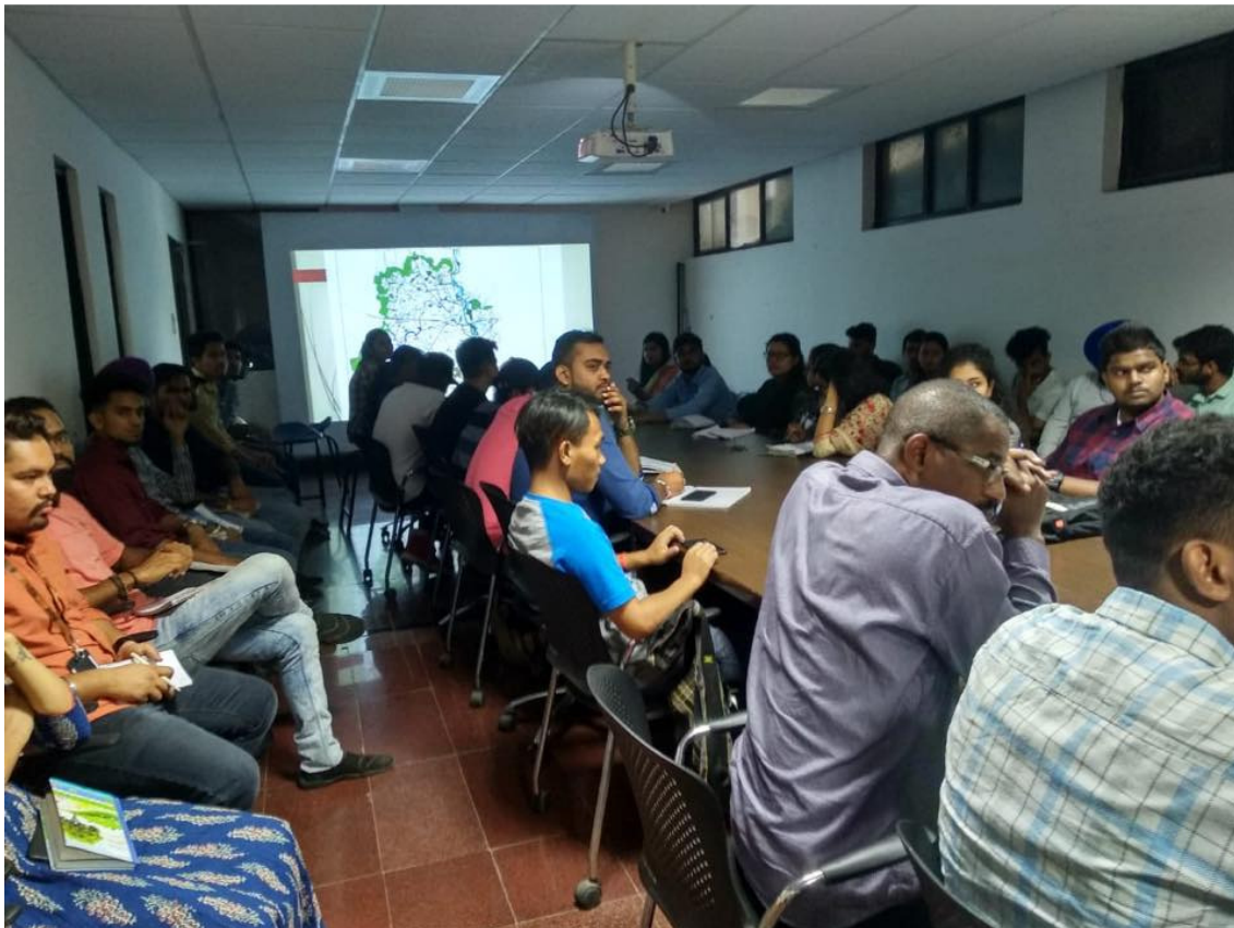
Picture 8 Round Table Discussion on Wastewater Management (with focus on Delhi NCT)

Today, the treatment of water is a well-known process and is executed by state of the art techniques. The sludge resulting from this process represents the next challenge for the water treatment industry, in particular the minimizing of its volume.