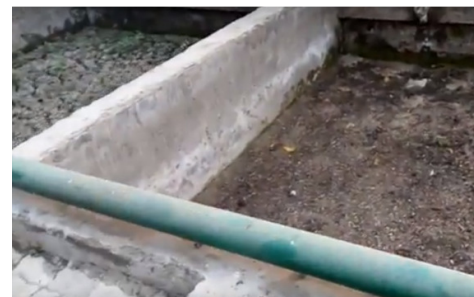
Picture 6 Few glimpses of the STP at Lovely Professional University